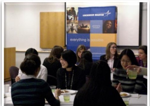
Students enjoy their catered dinners as they practice their etiquette