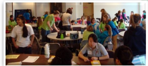
SWE members volunteer with local girl scouts to do activities like constructing water filters and creating paper cities