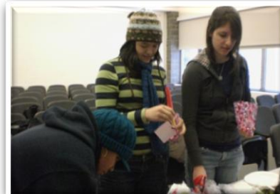
SWE members prepare for Valentine's Day after enjoying a light lunch by making candy bags filled with Hershey's Kisses and other sweets