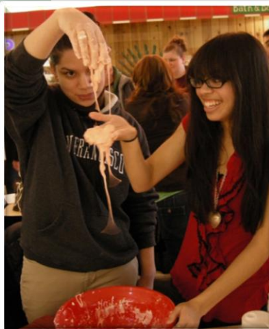
SWE members enjoy their time volunteering to help kids make silly putty at Ithaca Mall