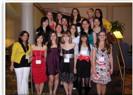
Cornell representatives at the SWE Region E Conference in Philadelphia